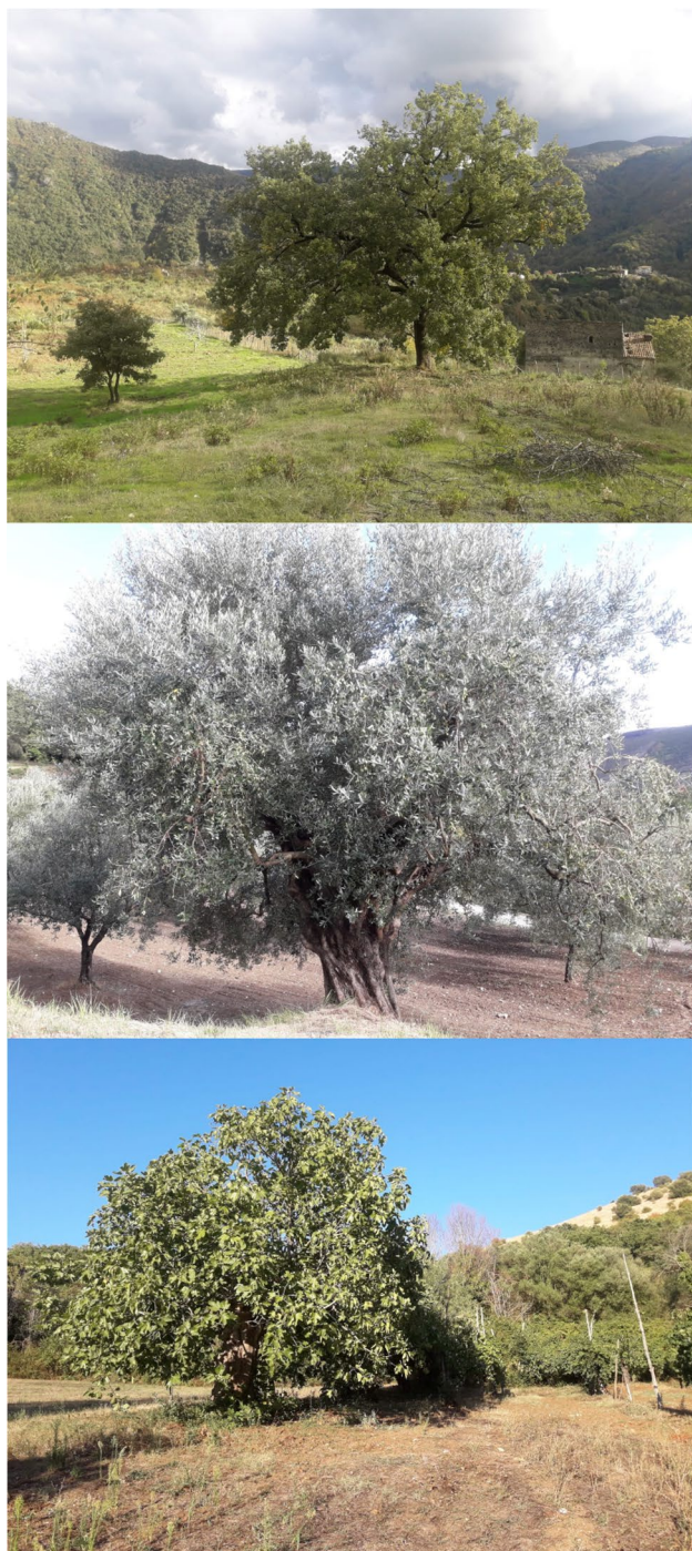
Fig. 2 Wild and cultivated old trees from Europe: a large old European oak ( Quercus robur , up); a large old olive tree ( Olea europaea , middle), and a large old fig tree ( Ficus carica , down). These photographs, when compared to Fig. 1, also demonstrate the difficulty in defining large old trees depending on interspecies characteristics. Although set apart, old singular trees contain superior genetics and have the potential to help create the forests of the future. Photos taken in Papisidero, Calabria (European oak) and Castel di Sasso, Campania (olive and fig trees), South Italy

natural compounds is of particular contemporary interest (Frieri et al. 2017; Slomski 2021).