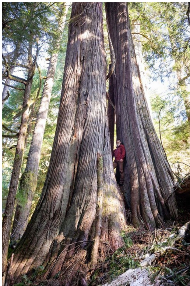
Fig. 1 The great Arborvitae, the tree of life. Note its size and girth when compared to the photographer, as well as the many creases and holes in the buttress system. These trees are ideal homes for many species and are only present in older trees. Apart from being an ideal habitat for many species, large old trees such as this one continue to sequester carbon while producing large amounts of beneficial aerosols. This particular specimen of Western redwood, Thuja plicata , was photographed by TJ Watt in the old-growth forests of Vancouver Island, British Columbia, Canada

and healthiest trees have already been culled, with some, such as the bur oak ( Quercus macrocarpa ) of North America being reduced to an inferior retrograde status, both stunted and twisted (Beresford-Kroeger 2003).