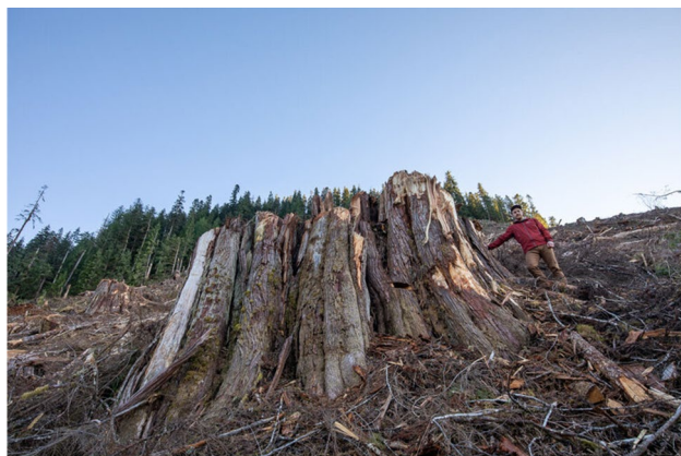
Fig. 4 The giant stump of a recently harvested tree of life or Western redwood, Thuja Plicata , and the surrounding destruction left by the logging industry. Note again the sheer size of these buttresses and the extent of the root system beneath which are able to hold large amounts of carbon-rich soil. Without this structure, the soil, and its carbon, is at risk of washing away with the increasing floods. This photograph was taken by TJ Watt in the old-growth forests of Vancouver Island, British Columbia, Canada

certainly influenced the fact that the designation of national or even world heritage site has been bestowed on many old-growth forests (Yang et al. 2021) and should factor into the protection of further such expanses.